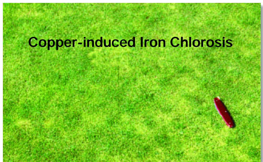
Relative residual moss control in plots treated the previous winter with Junction (Copper Hydroxide + Mancozeb), No-Mas (fatty acid soap), Daconil fungicide, and an untreated check plot.

Soap products have been used for many years for lawn moss control, and anecdotal reports of control with products such as Dawn Ultra detergent, which is not labeled as a pesticide, prompted evaluation of soap products for use on putting greens. We screened several products based on fatty acids, all of which were effective in killing